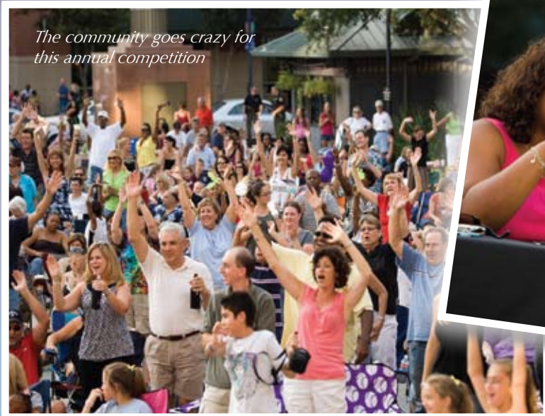
The community goes crazy for this annual competition